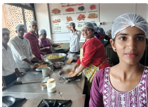
Diwali Faral Making