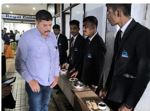
Ranj Bhaji Competition