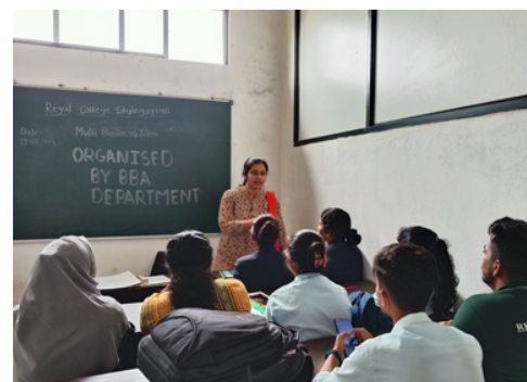
Multi Business Idea Activity