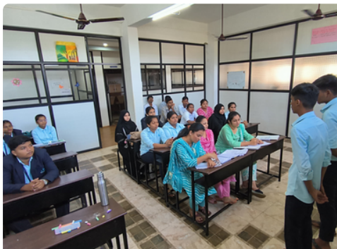
Product Marketing Activity