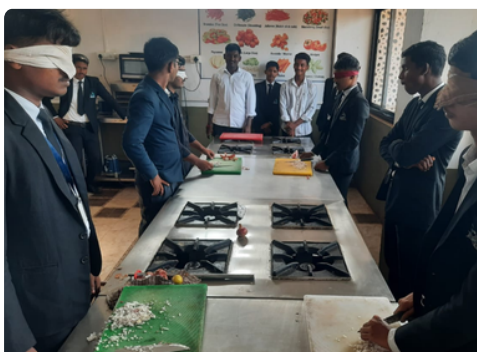
Blaind Cutting Competition