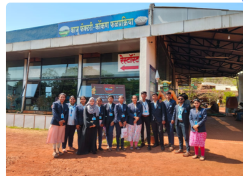
Industrial Visit @ Kaju Factory Dapoli